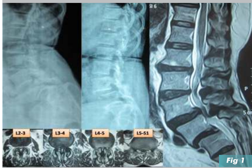
Preoperative radiographs showing spondylolisthesis and instability at multiple levels along with MRI picture showing severe stenosis from L2-3 to L5-S1 causing severe compression of cauda equina.

Patient Said - "She was advised to somehow manage her daily activities"